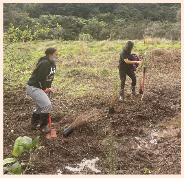
Planting native grasses along recently cleared awa, that had previously been concealed by 2 metere tall invasive blackberry.

cultivation skills and raise seedlings for crops as well as native trees for the ngāhere, and we are supporting them in making this happening them in making this happen.