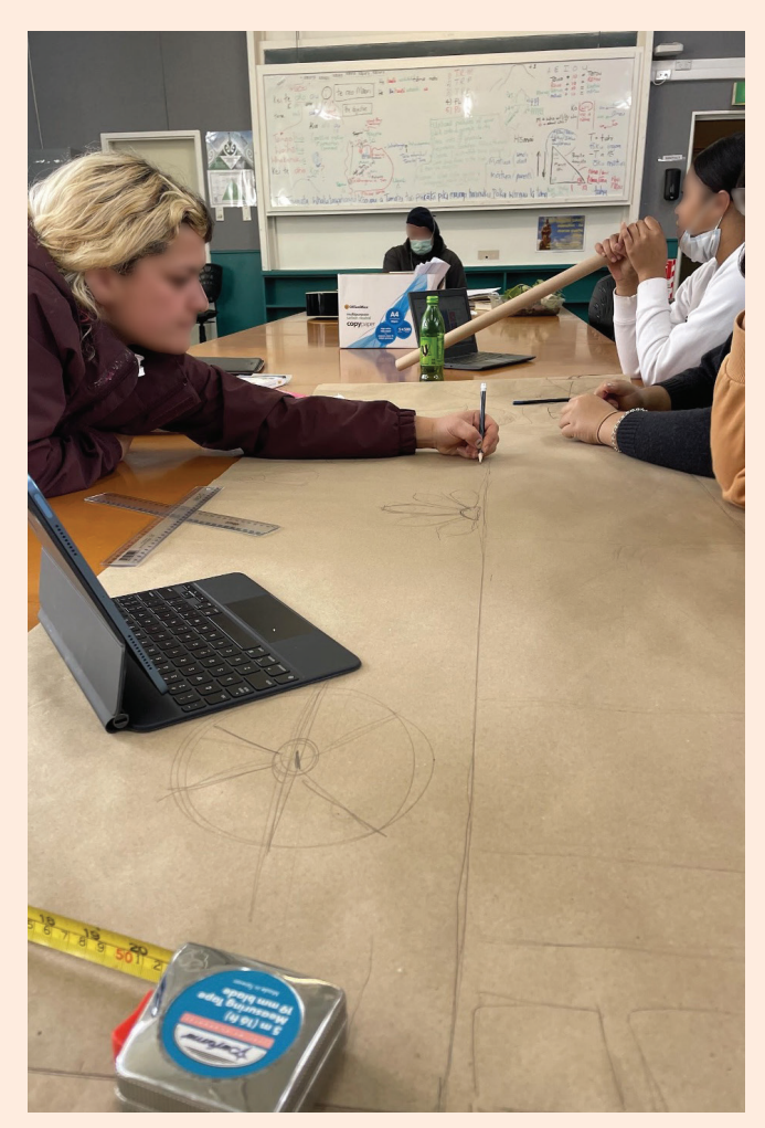
Planning and imagining the layout of our māra