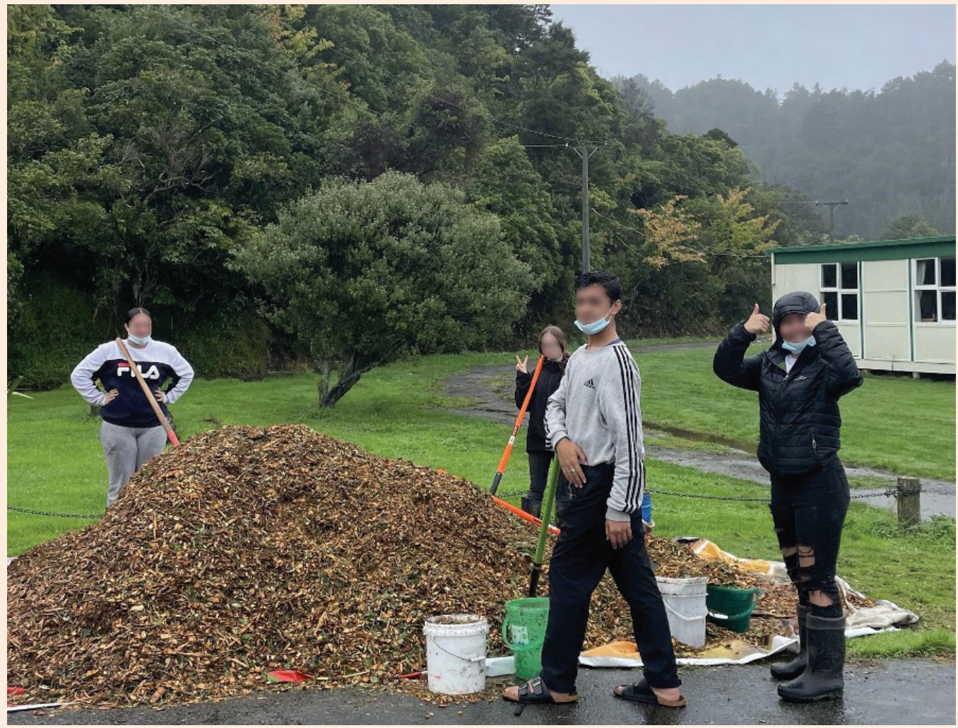
On our way to mulch ngā rākau whai hua

A central part of our work in spending time at this kura has been to strengthen relationships and build trust as we continue in this work together and as our vision for the māra grows. The school principal has been generous in supporting this project through some initial infrastructure, so we are looking forward to receiving our tunnel house, compost bins soon as well as some berries and fruit trees in the near future. From conversations as a collective, it seems we are all keen to support the opportunities to soon grow enough food to feed the whānau.